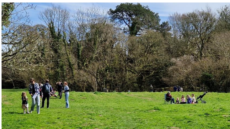
Some of our visitors enjoying sunshine in the meadow.