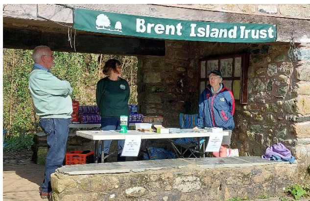
Committee members waiting for the clock to strike 10am and to greet the first visitors.

As you can imagine, the occasion was an outstanding success and provided families with the opportunity to eggsplore the Island – some of them for the first time.